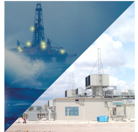
Ideal for installations with recurrent high humidity, industrial and rural environments as well as dry, arid and arctic areas.

The CamGT is available in a range of efficiencies to meet individual requirements from F8 to E10-H13 (H)EPA grade filters.